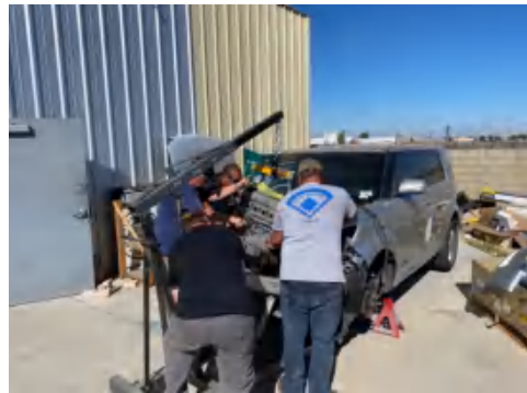
It takes a team to get it done...